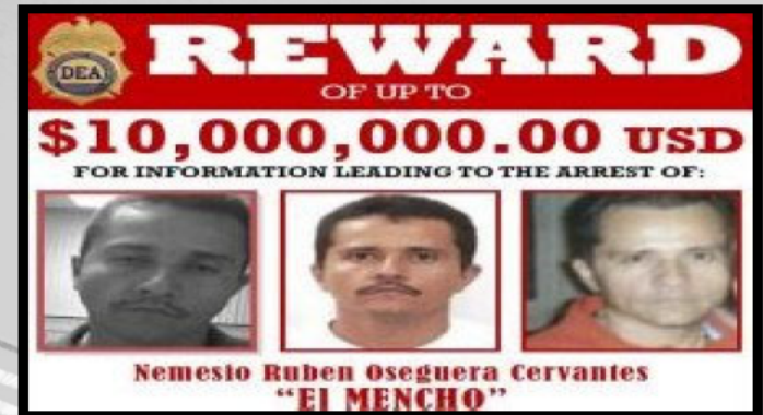
CJNG Leader; Designated April 8, 2015